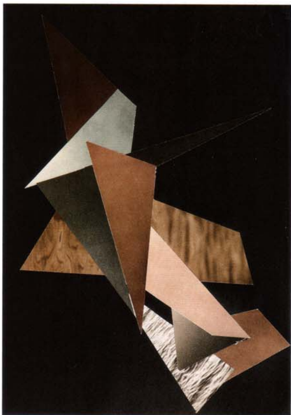
Katja Strunz Untitled (2007) Collage on paper 42x30.5cm